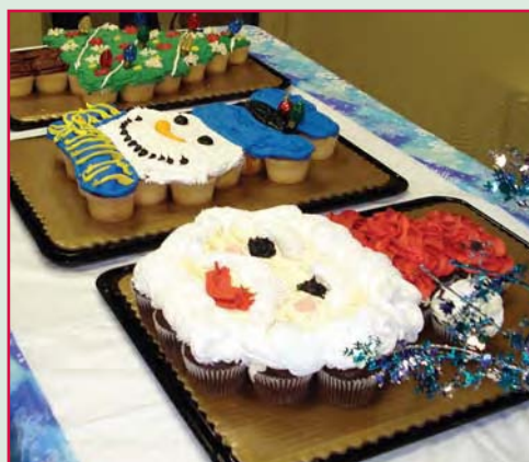
Festive holiday cupcakes were donated by the Masons for this year's party.