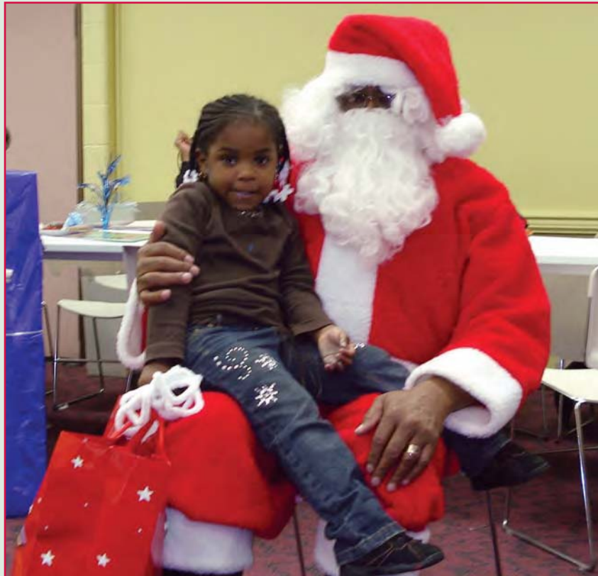
Santa visits with a guest at the Angel Tree Party.